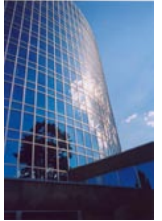
WIPO Headquarters - Geneva

"In a shocking verdict... the International WIPO court turned out a verdict of "Complaint Denied" for those who tried to wrest away ownership of UHJ. NET website from the true Baha'i people..."