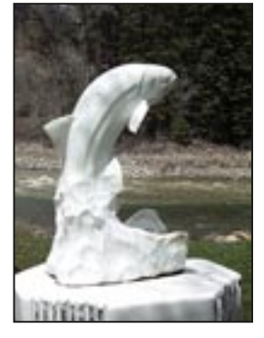
A Marble Mine in the Rockies

The spiritual food and memories I cherish so much and for the scattered ones I say: get your toothbrush and go on a pilgrimage to get a taste of this sweet flowing waters. The spirit of life indeed.