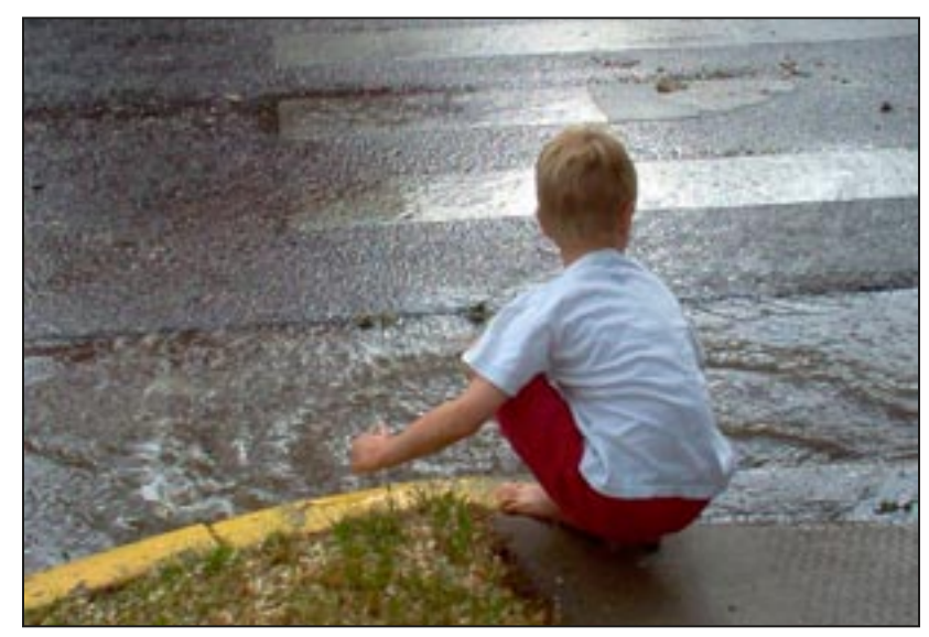
A Baha'i child at play